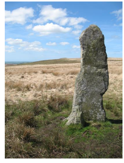
The Longstone with view towards Wood Barrow

The most substantial remains are the Chapman Barrows comprising at least eleven large Bronze Age burial mounds forming a cemetery along the Parish Boundary. The Reverend Chanter and others opened some of the barrows over a hundred years ago. The easternmost barrow was found to have