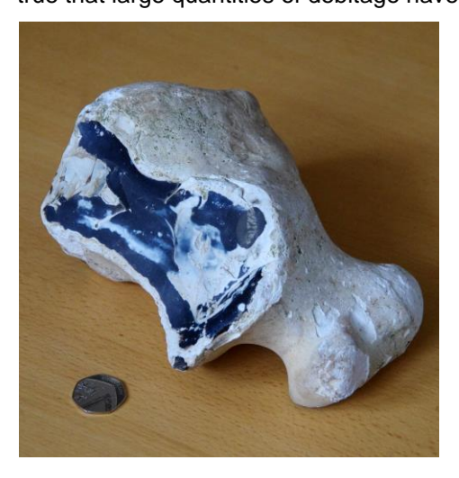
The flint nodule found in the River Heddon last year – stashed for future use and forgotten?

It is becoming increasingly obvious that the residue of prehistoric flint and chert knapping as well as the artefacts themselves are to be found, under suitable conditions, right across northern Devon. It was for a long time supposed that knapping sites were confined to the coastal areas, and in fact it is true that large quantities of debitage have been found at coastal sites such as Westward Ho! and