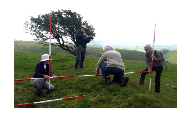
Measuring a boundary seen as a low earth bank at Radworthy